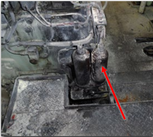
Two filters sprayed MDO on the turbocharger air inlet casing just above